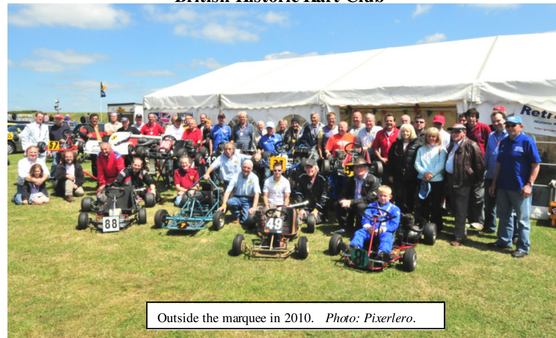
Outside the marquee in 2010.

Hosted by Shenington KRC at the Shenington SuperPrix and the British Historic Kart Club