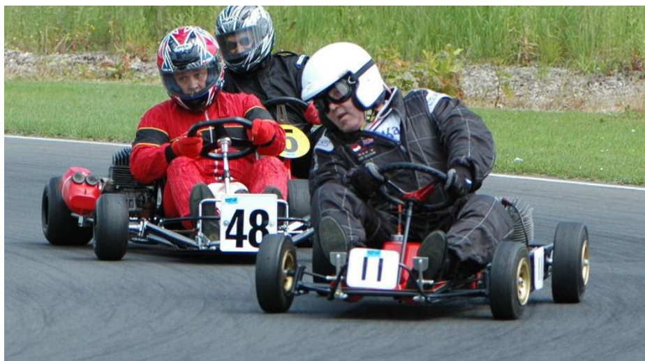
Top: Some of the Class 4 - 250cc karts on show.