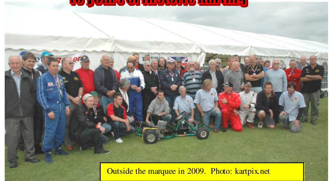
Outside the marquee in 2009.

Fifty Years of Shenington KRC & 10 years of Historic Karting