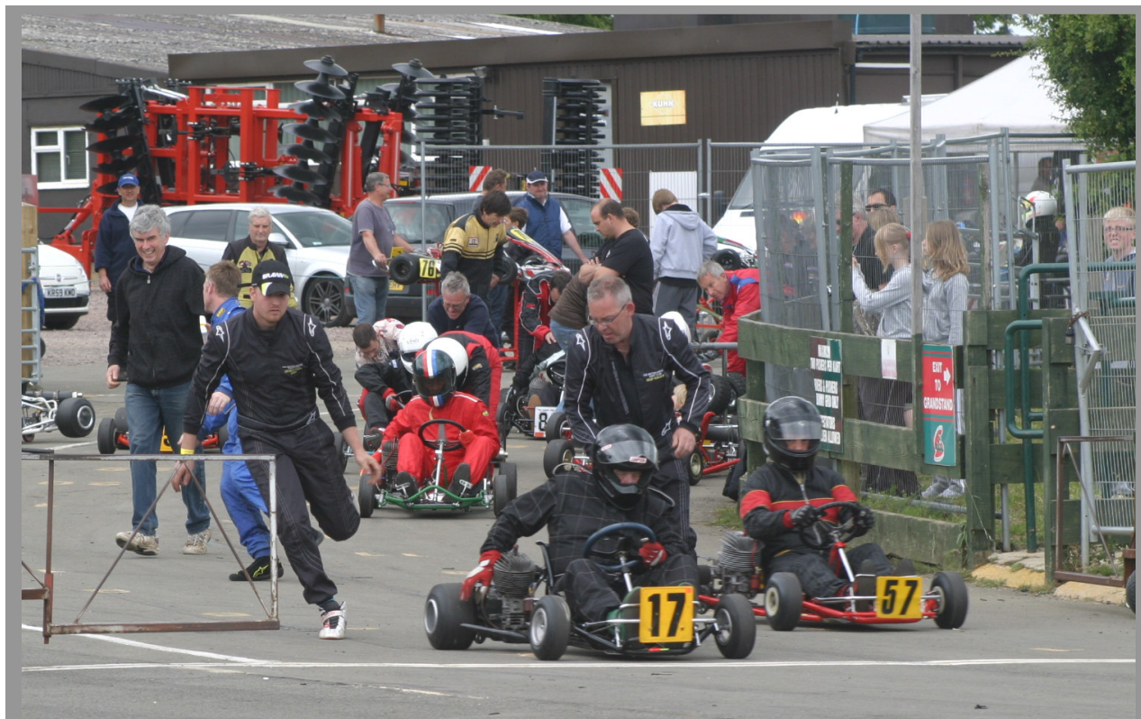
Class Ones leave the dummy grid in 2011.

Replicas sponsored by P&M Glass Coat Ltd.