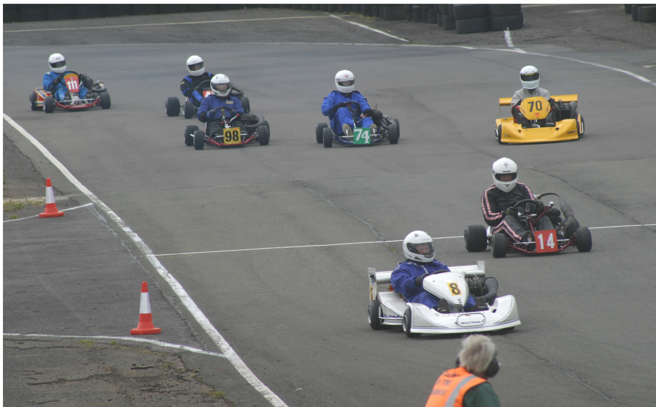
Class fours at Shenvington in 2011.