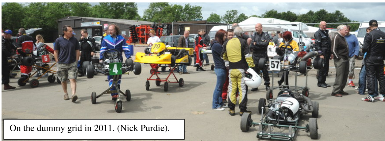
On the dummy grid in 2011. (Nick Purdie).