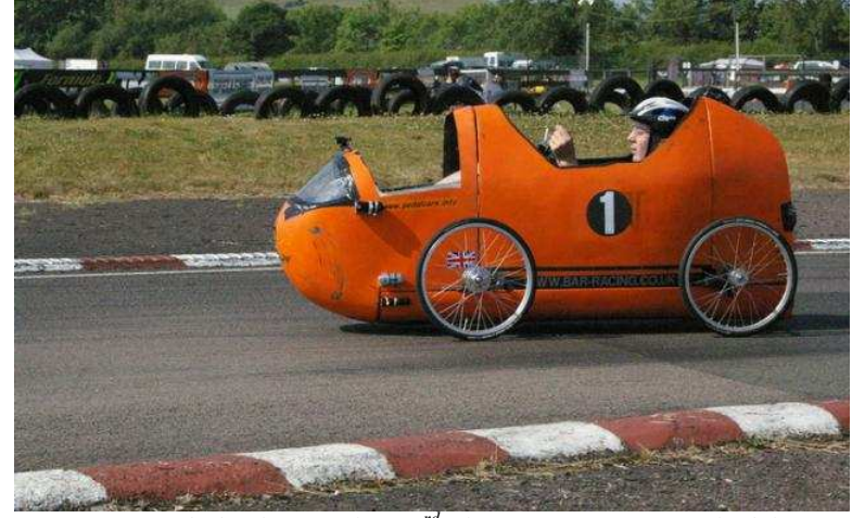
2009 winners BAR Racing fought back strongly to 3<sup>rd</sup> place in 2010 after early delays for chassis repairs.

This is the main place where you can check the timing and scoring screen as well so why not drop in, take a well earned break, and have a nice cup of tea while you catch up on how the race is going.