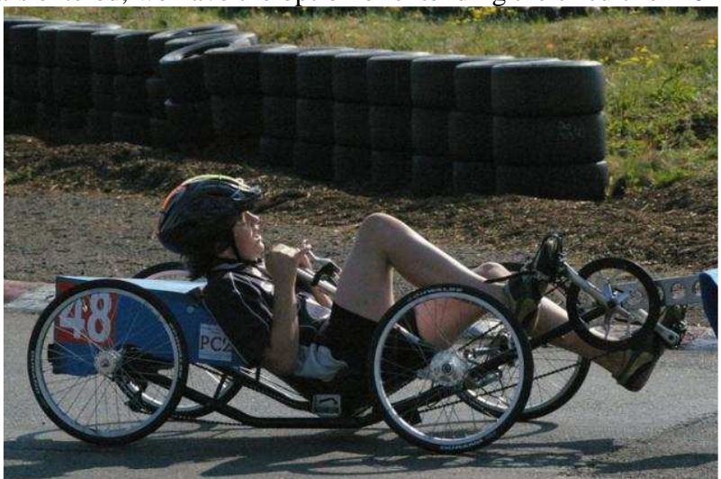
"Atom" won the PC2 (under 16's) class in 2010

If we get more than 42 cars entered, we have the option of extending the circuit for 2011.