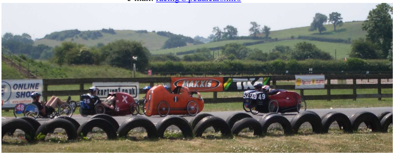
...and the view isn't bad either...