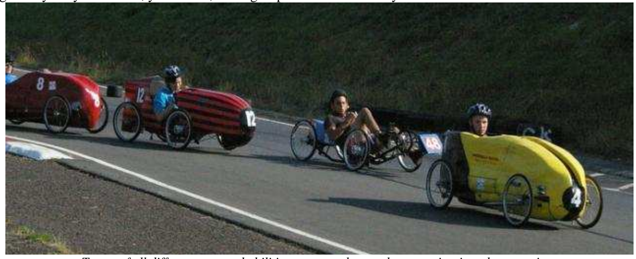
Teams of all different ages and abilities race together on the same circuit at the same time. Negotiating slower cars is something the fast teams have to get good at!

raising money for your school, youth club, scout group or favourite charity.